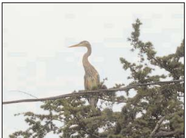
A neighbor on Rutherford captured this unusual site—our own Canyon Crane!