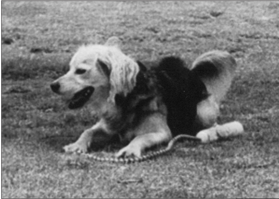
Above: Bullet approximately 6 months old.

there other pups abandoned elsewhere? How many dogs have just one pup in their litter? Not many, I'm sure. And who does these things? Are the cruel compelled by evil? Boredom? Anger? Just plain laziness? Is it dullness or meanness, or God's mistake that allows one to pay such little attention to life? I can't begin to guess. I do know that I am delighted by my enterprising pup with his mischievous smile and