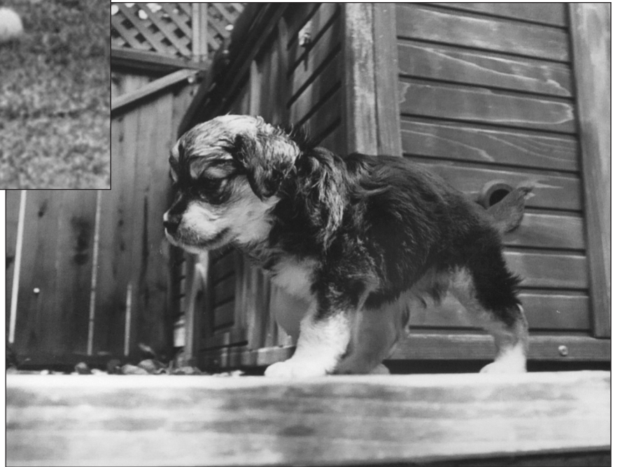
Right: Bullet approximately 5 weeks old.

loaf's person, was having none of it. Each time Meatloaf veered toward the alleyway garbage cans she pulled him back, "I don't know what you think you're doing, buddy. Trust me there is nothing in those trash cans for you..." But all good relationships are